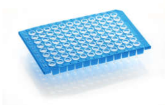
Figure 1: Break-a-way plate