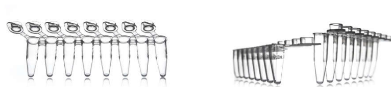
Figure 4: 8 tube PCR strips with individually attached caps.

The tubes are from clear, transparent polypropylene.